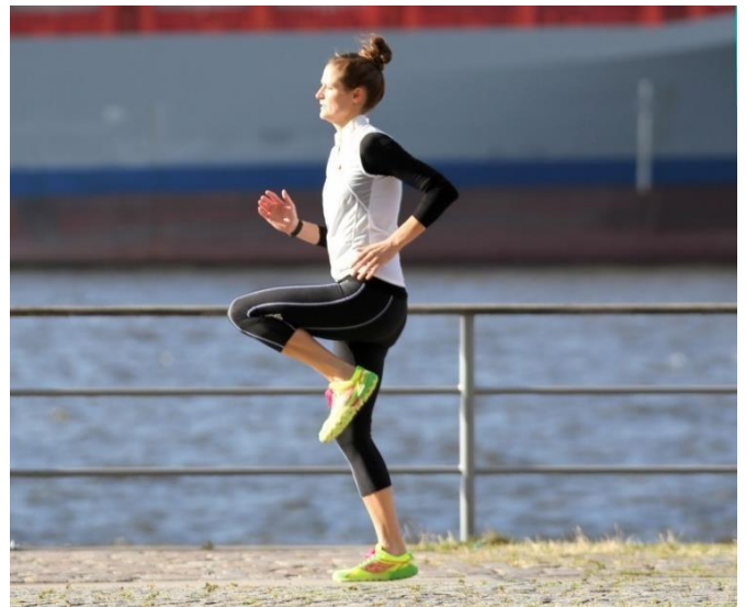
High knee jogging